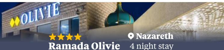
★★★★★ Ramada Olivie 4 night stay 📍 Nazareth