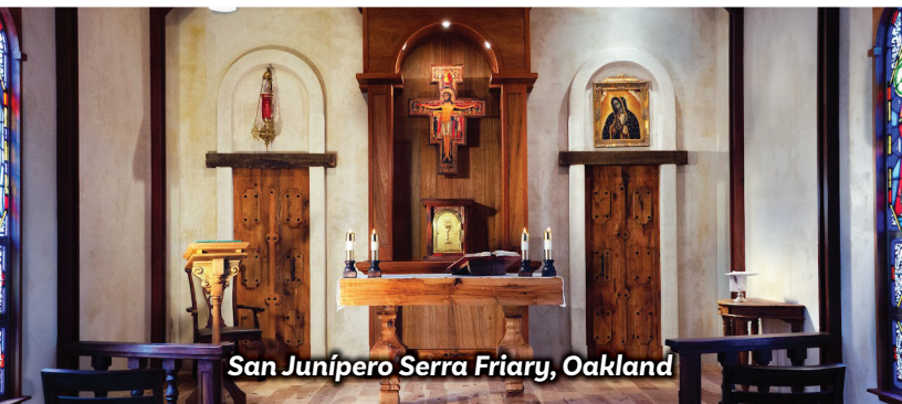
San Junípero Serra Friary, Oakland