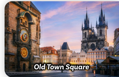
Old Town Square

With a renewed sense of pilgrimage, an invigorated love of our Catholic faith, and many new friends, we board the plane for the return flight home from Prague.