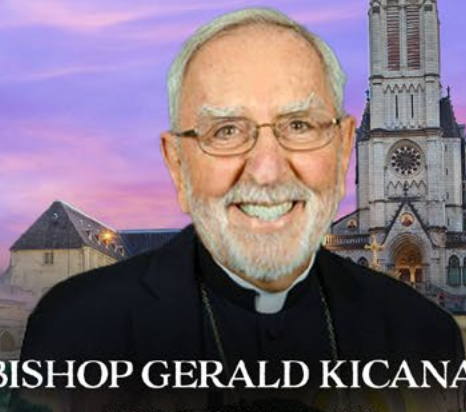
BISHOP GERALD KICANAS YOUR CHAPLAIN

TO LEARN MORE & REGISTER, VISIT CANTERBURYPIILGRIMAGES.COM (800) 653-0017