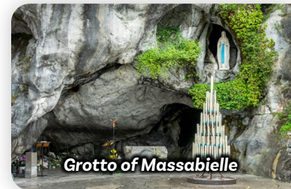
Grotto of Massabielle

After breakfast and hotel check-out, we transfer to the Paris Airport for our return flights home, filled with the peace and blessings of our pilgrimage through Portugal, Spain, and France.